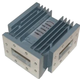
Note: Photo is for illustration purposes only. Please refer to outline drawing.