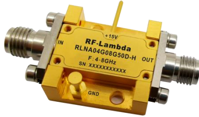
Note: Photo is for illustration purposes only. Please refer to outline drawing.