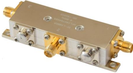
Photo is for illustration purpose only Please refer to outline drawing