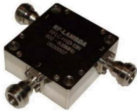
Note: Photo is for illustration purposes only. Please refer to outline drawing.