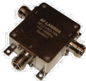
Note: Photo is for illustration purposes only. Please refer to outline drawing.